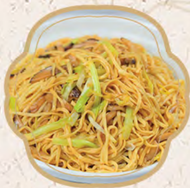
北菇乾燒伊麵 $18.95 E-fu Noodle with Shiitake Mushroom