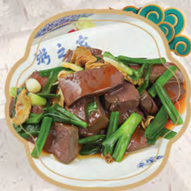
薑蔥鴨紅 $17.95 Sautéed Duck's Blood with Ginger & Scallion