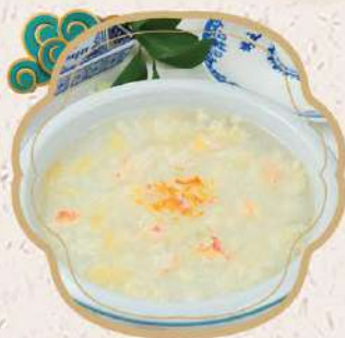
百花魚肚羹 $25.95 Fish Maw & Seafood Soup