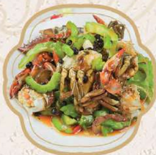
涼瓜炒蟹仔 $25.95 Sautéed Blue Crab with Bitter Melon