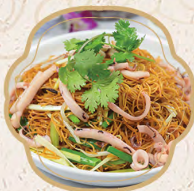
豉油皇吊片炒麵 $18.95 Soy Sauce Chow Mein with Squid