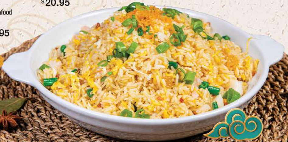
金雙蛋炒飯 $18.95 Golden Egg Seafood Fried Rice