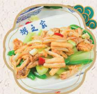
X.O. 蜜豆桂花蚌 $38.95

Sautéed Sea Clam & Sweet Pea Pod with X.O. Sauce