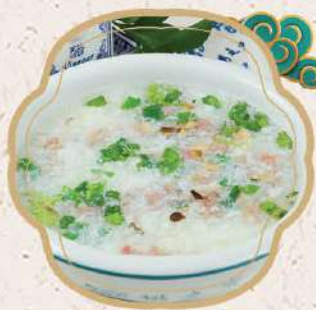
西湖牛肉羹 $20.95 West Lake Beef Soup