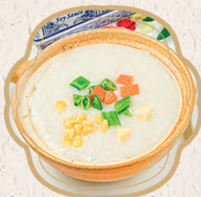
雜糧粥 $7.75 Mixed Vegetable Porridge