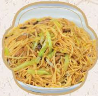
北菇乾燒伊麵 $18.95 E-fu Noodle with Shiitake Mushroom