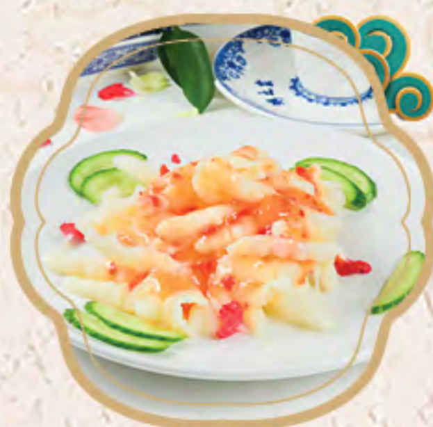
泰式鳳爪 $22.95 Cold Boneless Chicken Feet with Thai Sauce