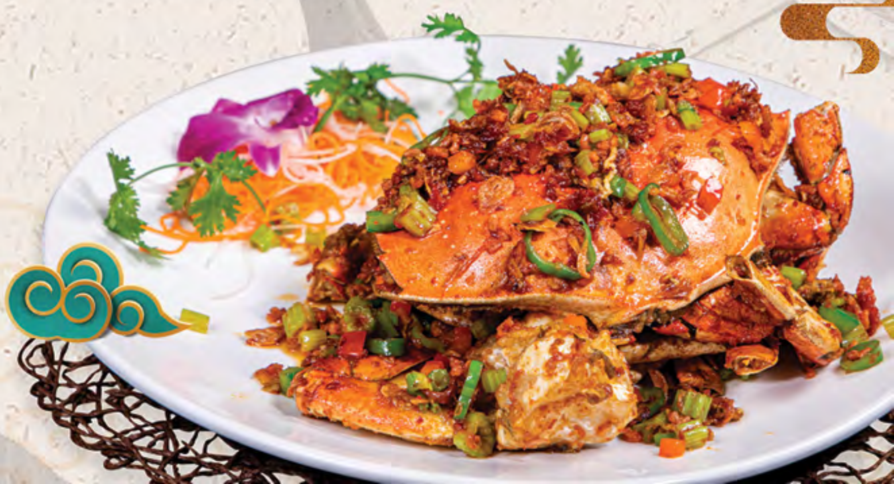
避風塘炒大蟹 S.P. Sautéed Dungeness Crab with Garlic & Pepper