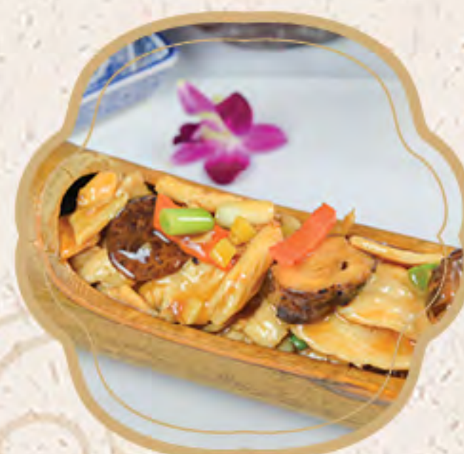
北菇滑雞燉飯 $10.95 Rice Baked with Chicken & Mushroom