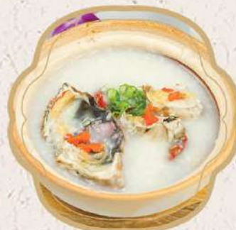
鮮蟹粥 $8.75 Blue Crab Porridge