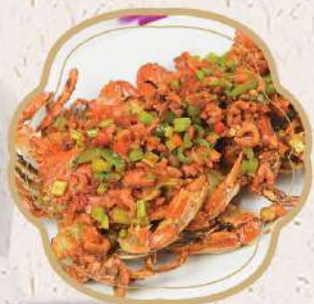
避風塘炒蟹仔 $24.95 Sautéed Blue Crab with Garlic & Pepper