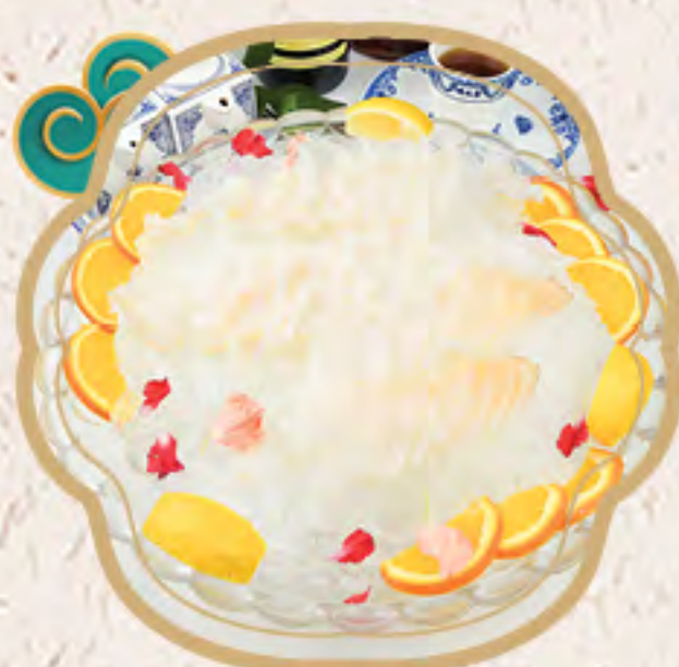
象拔蚌 S.P. Geoduck Clam Sashimi