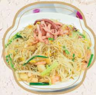
大鵬炒米粉 $18.95 Ta Peng Style Mei Fun with Squid