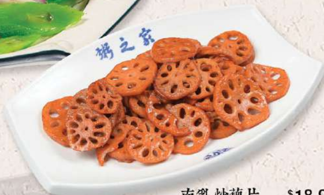
南乳炒藕片 $18.95 Sautéed Lotus Root with Bean Paste