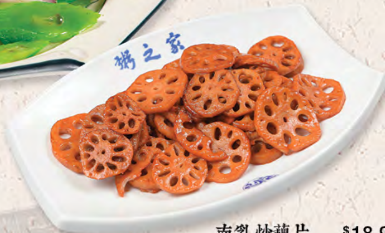
南乳炒藕片 $18.95 Sautéed Lotus Root with Bean Paste