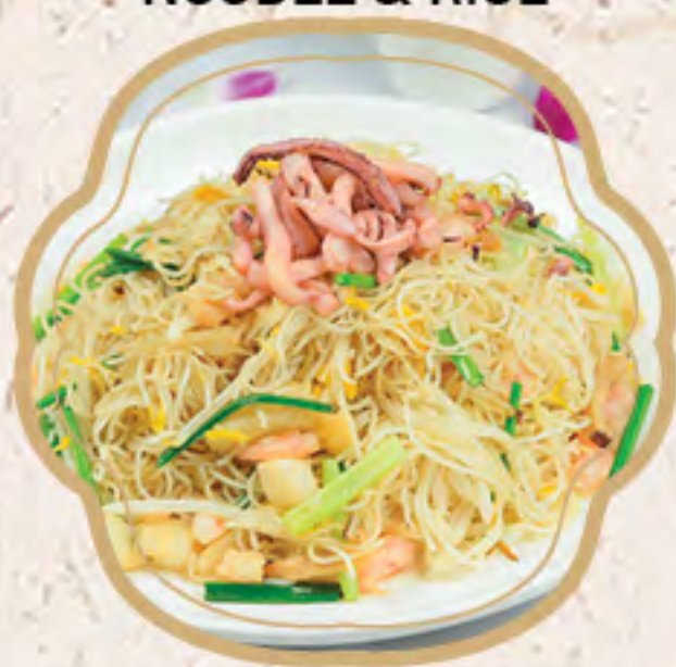
大鵬炒米粉 $18.95 Ta Peng Style Mei Fun with Squid