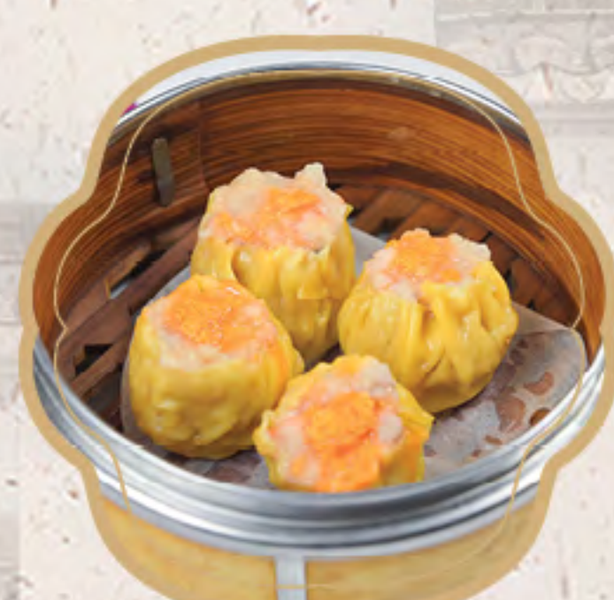
燒賣 (4 PCS) $6.95 Steamed Pork Shui Mai