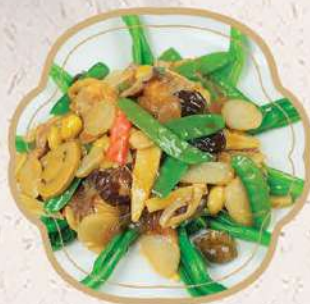
羅漢齋 $18.95 Assorted Vegetables & Vermicelli in Buddhist Style