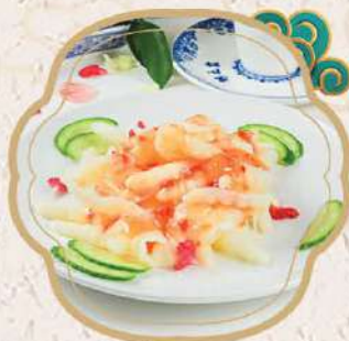
泰式鳳爪 $22.95 Cold Boneless Chicken Feet with Thai Sauce