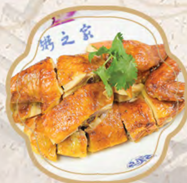
鹽焗雞 $18.95 / 半隻 $35.95 / 一隻 Baked Salted Chicken in Country Style (Half / Whole)