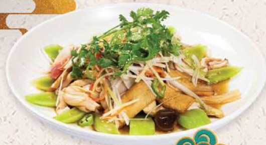
日式芥末撈三鮮 $33.95 Seafood Delight with Wasabi Sauce