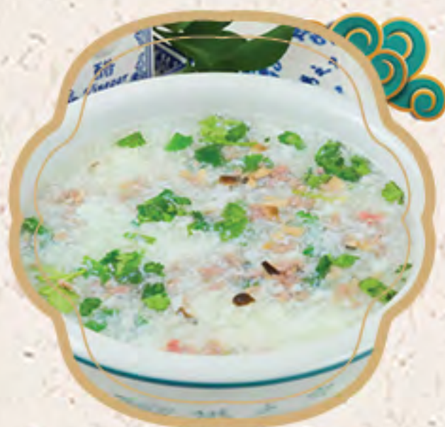
西湖牛肉羹 $20.95 West Lake Beef Soup