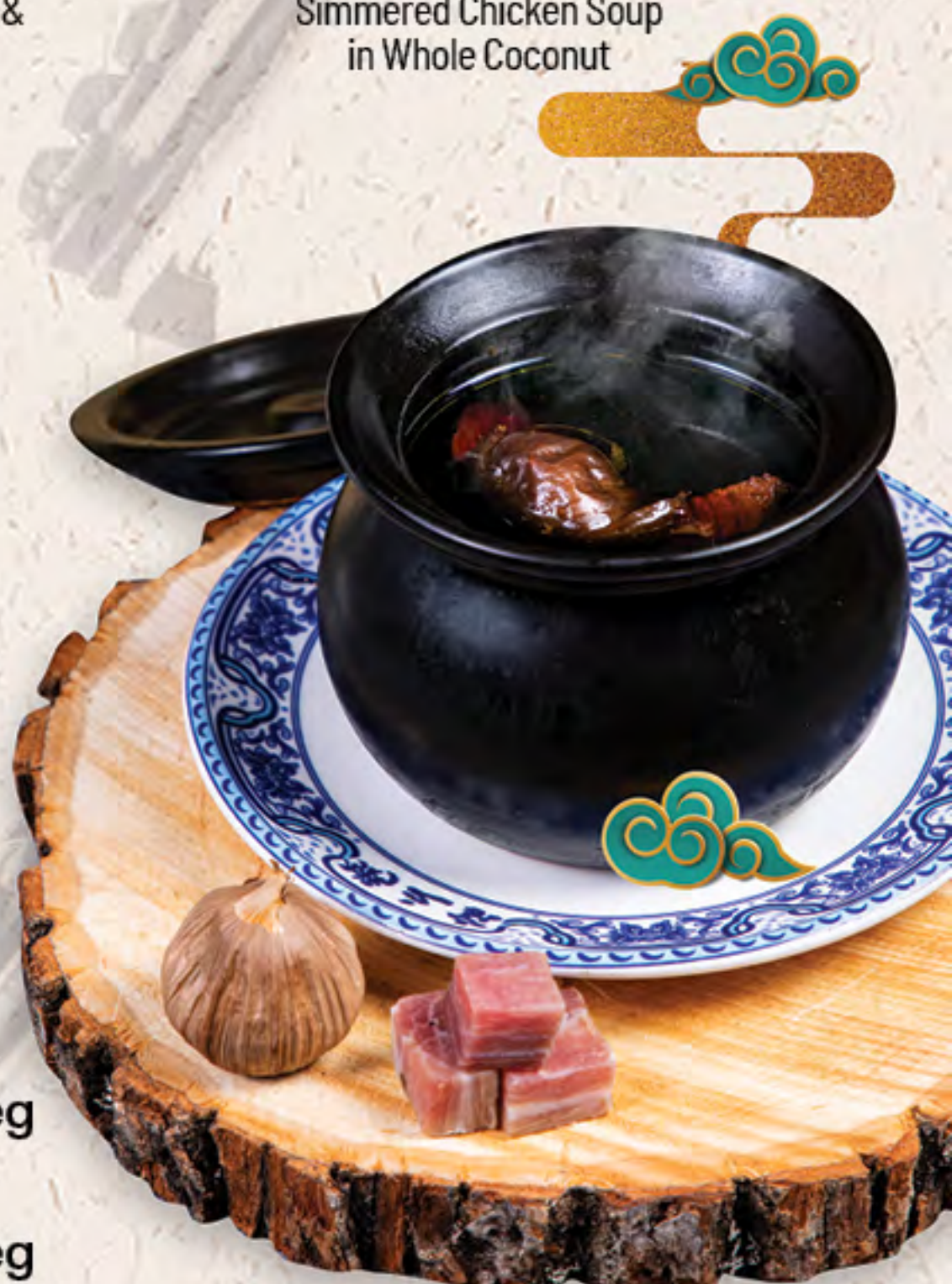
金蒜炖雞湯 $10.95/For 1 $98.95/For 10 Simmered Chicken Soup with Black Garlic