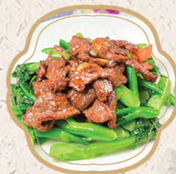
唐芥蘭炒牛肉 $22.95 Sautéed Beef with Chinese Broccoli

紅酒牛肋骨 $36.95 Beef Rib with Red Wine Sauce