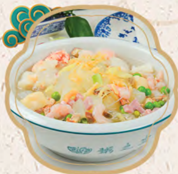
什錦冬瓜湯 $18.95 Winter Melon Soup with Chicken, Pork & Shrimp