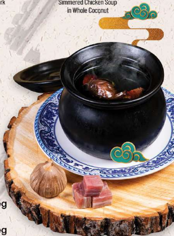
金蒜炖雞湯 $10.95/For 1 $98.95/For 10 Simmered Chicken Soup with Black Garlic