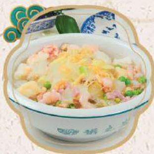
什錦冬瓜湯 $18.95 Winter Melon Soup with Chicken, Pork & Shrimp