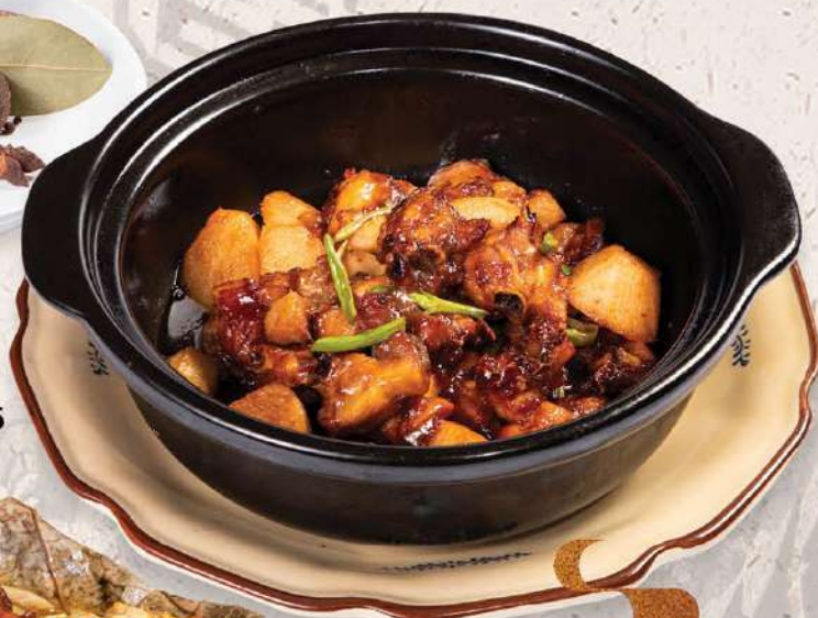
鮮淮山燜雞 $26.95 Braised Chicken & Fresh Chinese Yam