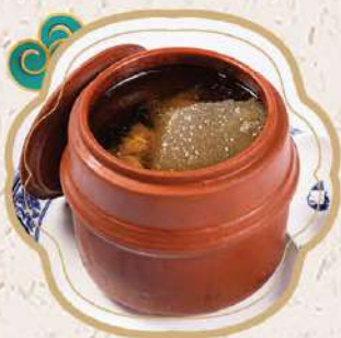
原盅干貝冬瓜湯 $10.95/For 1 $98.95/For 10 Simmered Dried Scallop Winter Melon Soup with Chicken & Pork