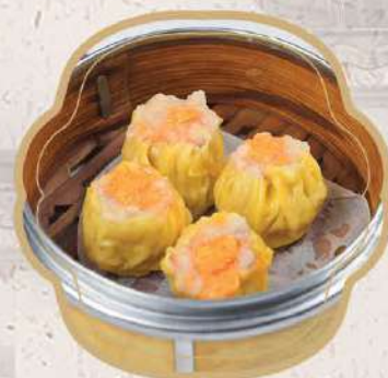
燒賣 (4 PCS) $5.95 Steamed Pork Shui Mai