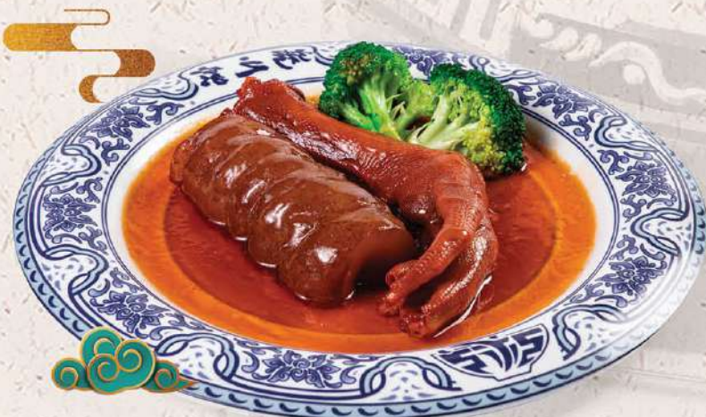
鮑汁鵝掌刺參 $23.95 Sea Cucumber & Goose Web with Abalone Sauce

碧綠鮑片海參 $54.95 Sea Cucumber & Sliced Abalone with Green Vegetable