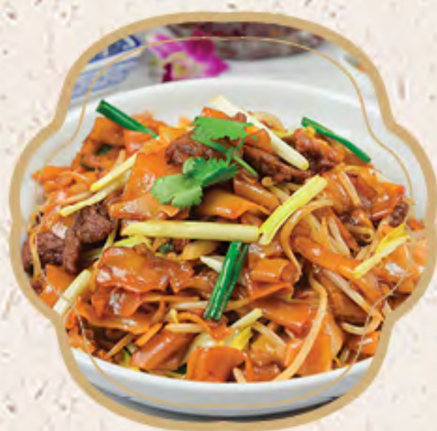
乾炒牛河 $18.95 Beef Chow Fun Noodle