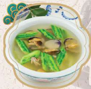
勝瓜花蜆湯 $21.95 Manila Clam & Squash Soup