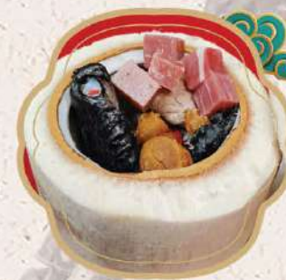
椰青燉雞湯 $20.95/For 1 Simmered Chicken Soup in Whole Coconut