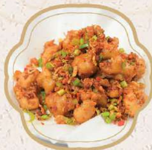
風沙田雞 $28.95 Fried Frog with Garlic, Salt & Pepper