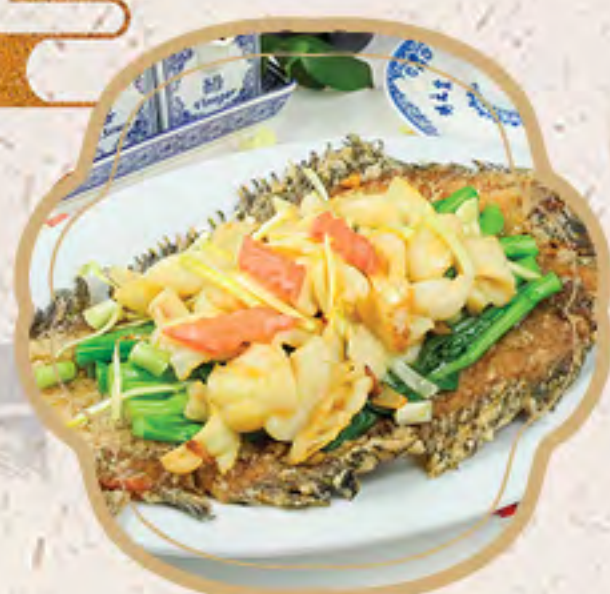
骨香龍利球 $36.95 Sautéed Flounder Fillets & Vegetable with Crispy fin