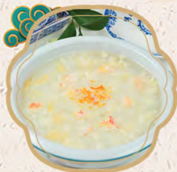
百花魚肚羹 $25.95 Fish Maw & Seafood Soup