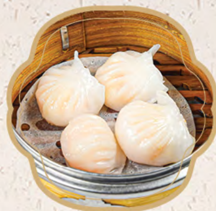
蝦餃 (4 PCS) $7.95 Steamed Shrimp Dumplings