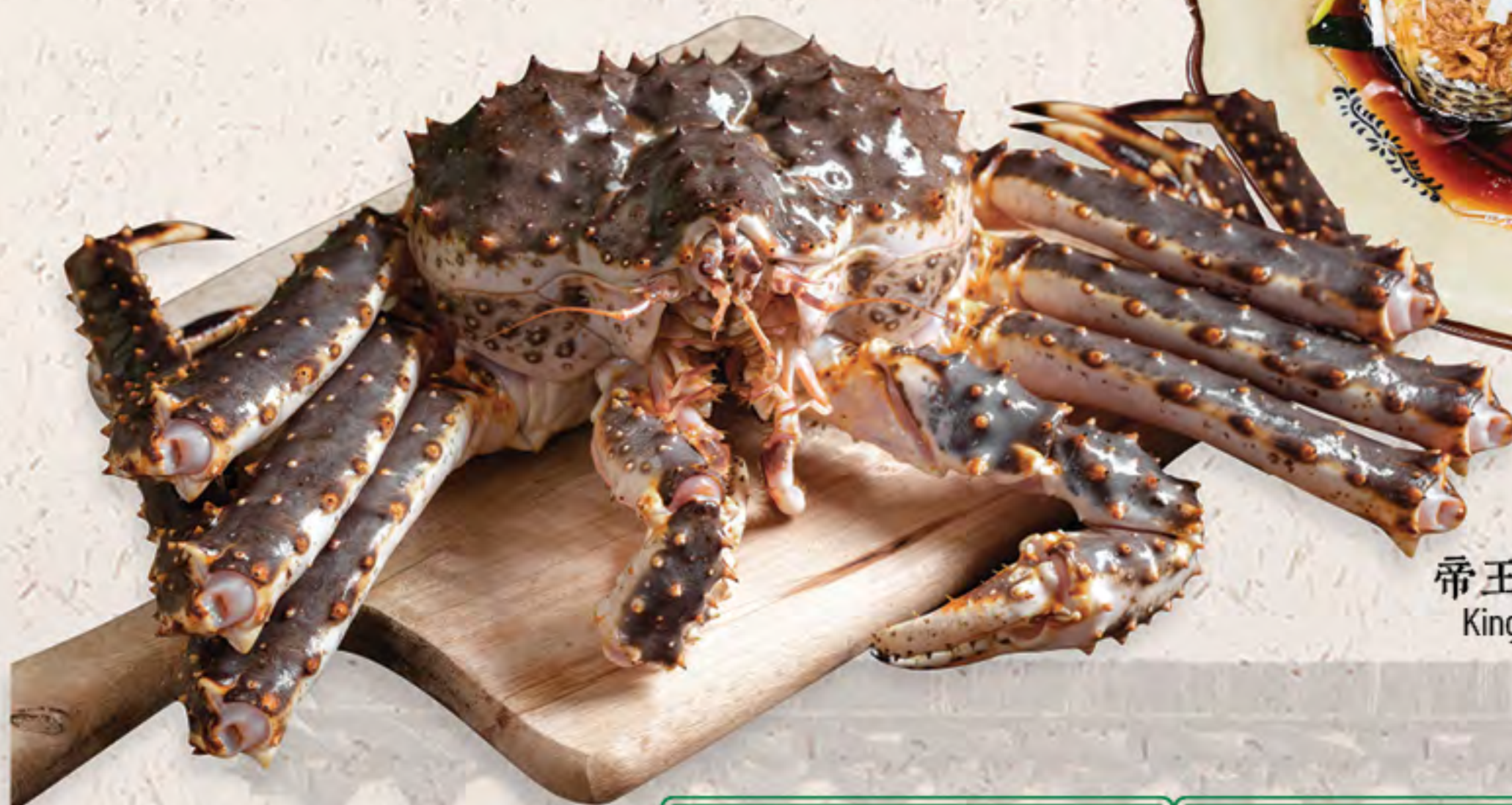
帝王蟹三食 S.P. King Crab in Three Tastes