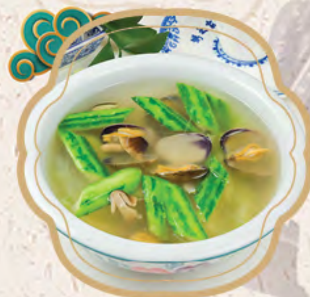
勝瓜花蜆湯 $21.95 Manila Clam & Squash Soup