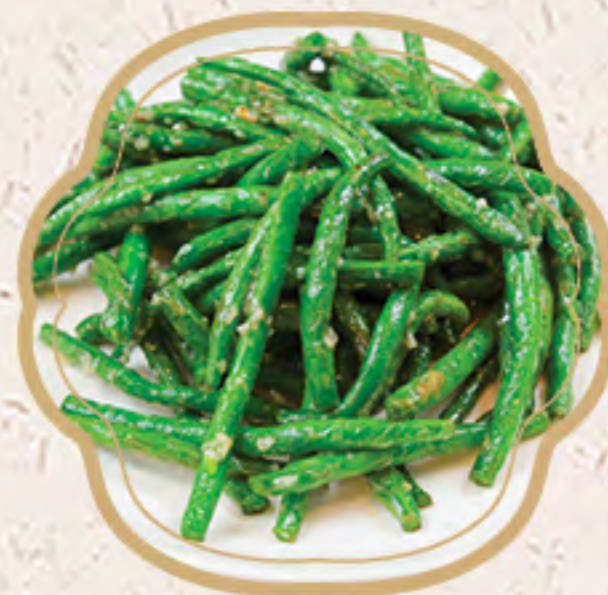
蒜蓉四季豆 $18.95 Sautéed String Bean with Garlic