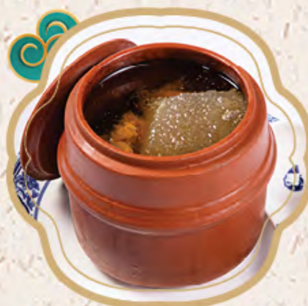
原盅干貝冬瓜湯 $10.95/For 1 $98.95/For 10 Simmered Dried Scallop Winter Melon Soup with Chicken & Pork