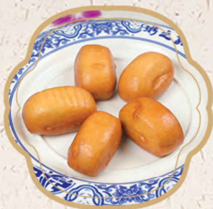
炸饅頭 (5 PCS) $4.95 Fried Bread