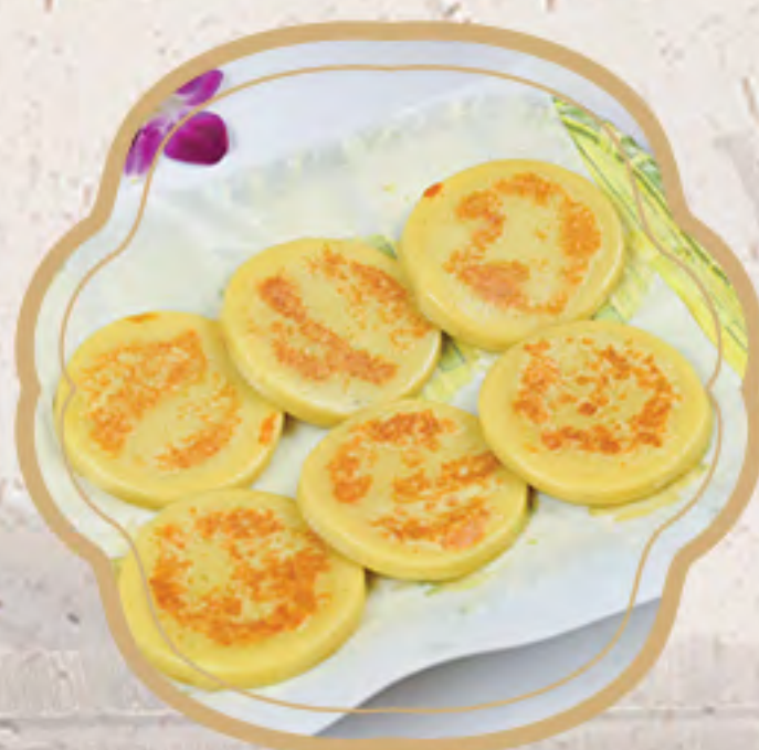
蕃薯餅 (6 PCS) $8.50 Sweet Potato Pan Cake