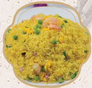
楊洲炒飯 $16.95 Young Chow Fried Rice with Pork & Shrimp