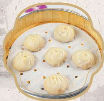
上海小籠包 (6 PCS) $8.95 Small Juicy Bun in Shanghai Style