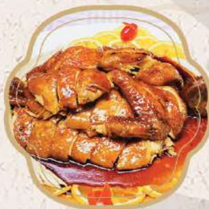
豉油雞 (需預訂) $48.95 / 一只 Soy Sauce Chicken (Pre-order only) (Whole)