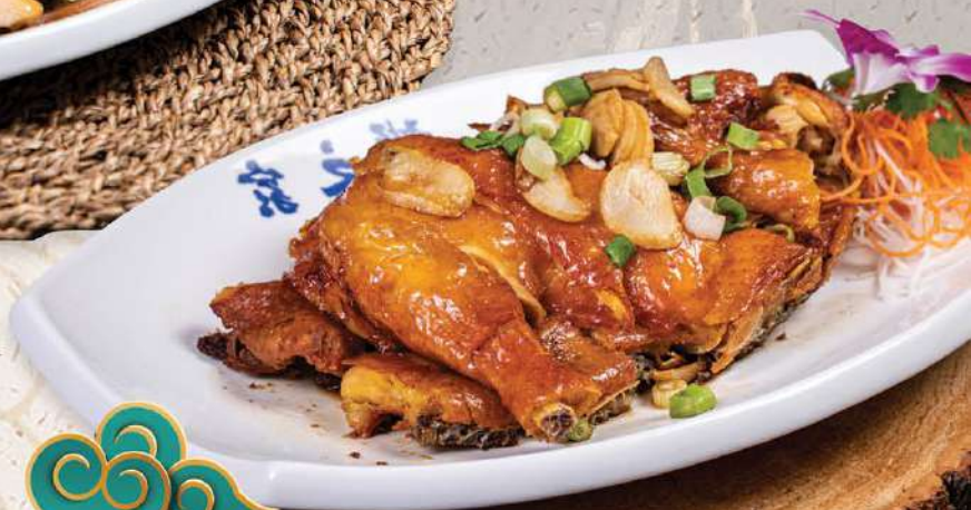
蒜香雞 $17.95 / 半隻 $33.95 / 一隻 House Special Chicken with Garlic (Half / Whole)