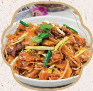
干炒牛河 $18.95 Beef Chow Fun Noodle