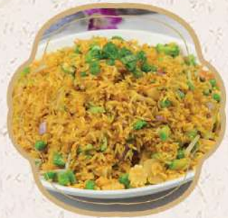
什菜炒飯 $16.95 Assorted Vegetable Fried Rice