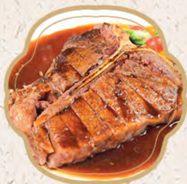
本樓煎士的 $33.95 House Special T-Bone Steak