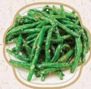
蒜蓉四季豆 $18.95 Sautéed String Bean with Garlic