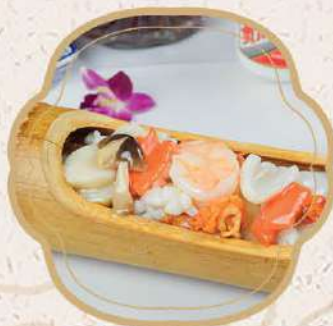
海鮮燉飯 $12.95 Rice Baked with Seafood