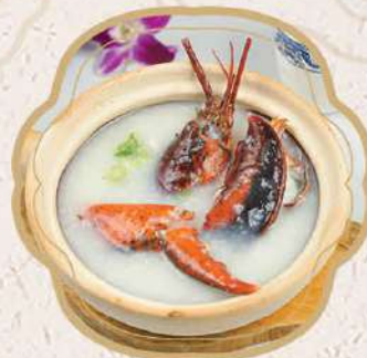
龍蝦粥 $12.95 Lobster Porridge