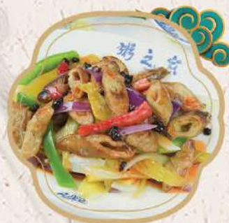
酸菜大腸 $16.95 Sautéed Pig's Intestine with Pickled Vegetable