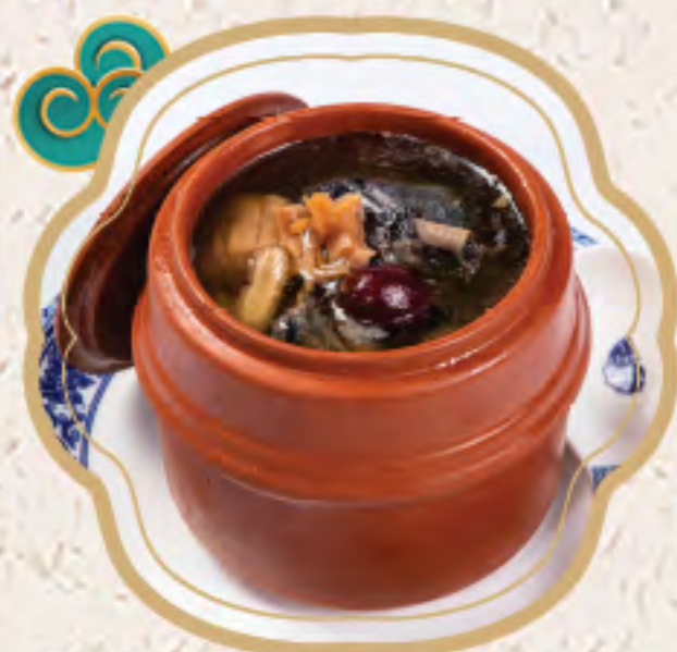
花旗參炖竹絲雞 $10.95/For 1 $98.95/For 10 Simmered Ginseng Chicken Soup with Pork & Conch