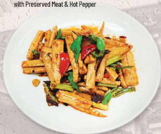
角椒臘肉炒春筍 $24.95 Sautéed Bamboo Shoot with Preserved Meat & Hot Pepper