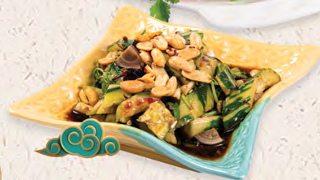
涼拌皮蛋黃瓜 $18.95 Cold Pickles with Preserved Egg