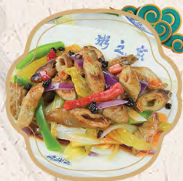
酸菜大腸 $16.95 Sautéed Pig's Intestine with Pickled Vegetable