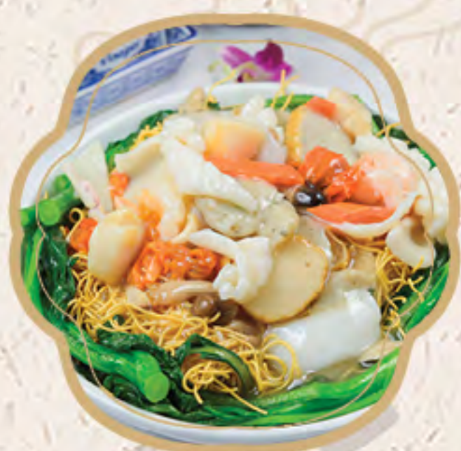
海鮮炒麵 $19.95 Seafood Chow Mein