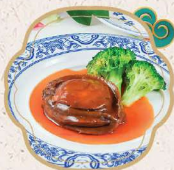
原隻紅燒鮑魚 S.P Braised Whole Abalone

Sea Cucumber with Dried Scallop (For 10)