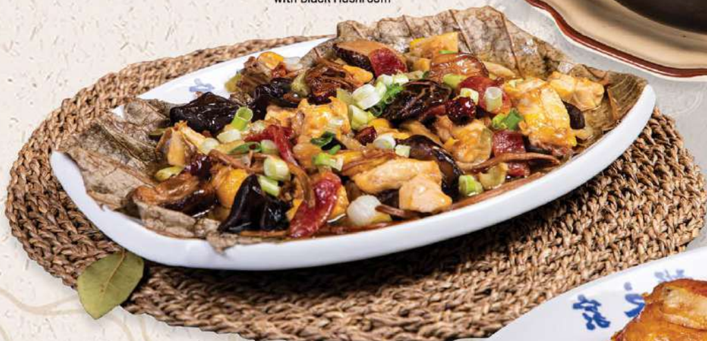
荷葉金針雲耳蒸鴛鴦雞 $31.95 Steamed Chicken & Frog with Black Mushroom