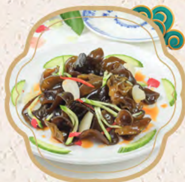
香醋拌木耳 $16.95 Black Fungus with Aged Vinegar