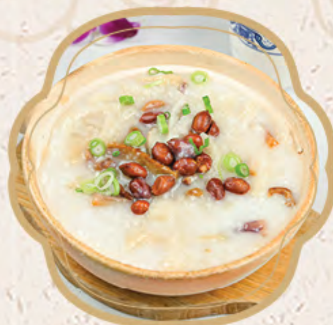
荔灣艇仔粥 $8.50 Sampan Porridge