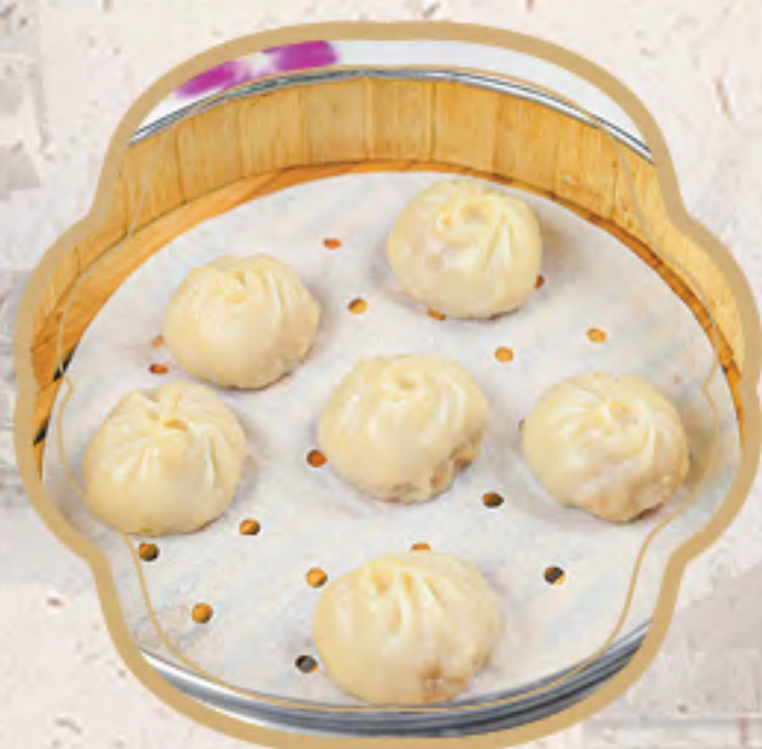
上海小籠包 (6 PCS) $10.95 Small Juicy Bun in Shanghai Style