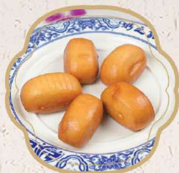
炸饅頭 (5 PCS) $4.95 Fried Bread