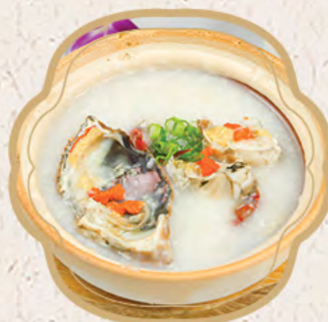
鮮蟹粥 $9.75 Blue Crab Porridge