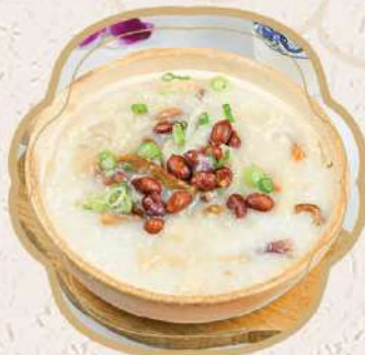
荔灣艇仔粥 $7.50 Sampan Porridge