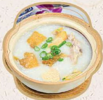
家鄉咸雞粥 $7.50 Salted Chicken Porridge