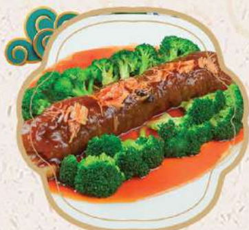
瑤柱扒原條黃玉參 $128 (10 位用)

Sea Cucumber with Dried Scallop (For 10)