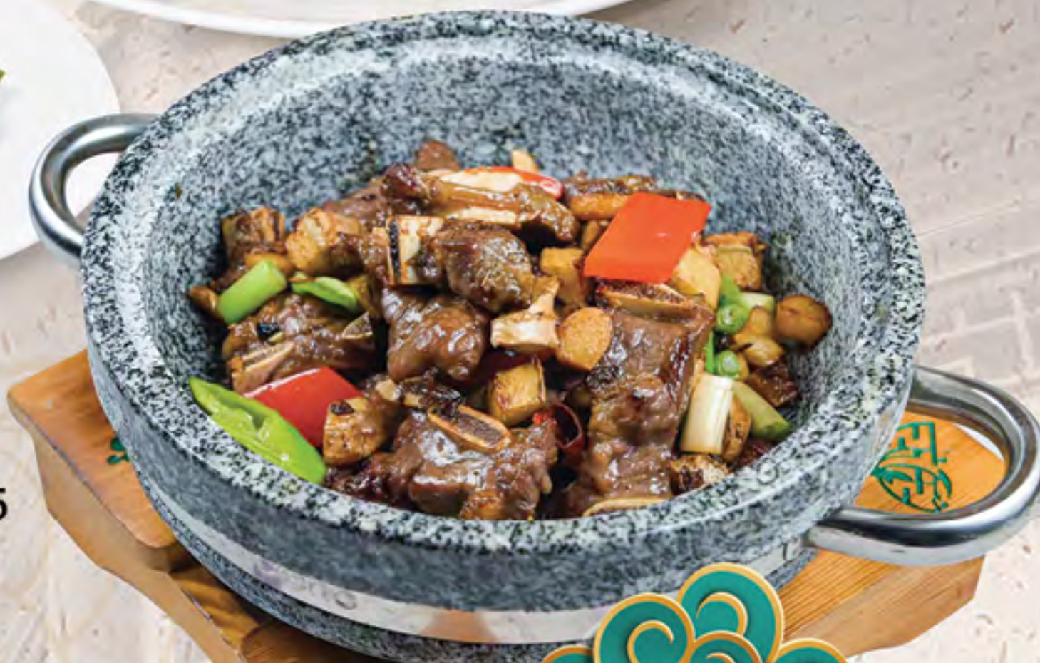
石燒幹壁牛仔骨 $28.95 Short Rib in Stone Pot