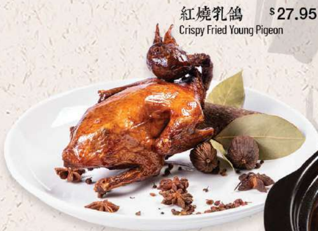
紅燒乳鴿 $27.95 Crispy Fried Young Pigeon