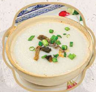
皮蛋瘦肉粥 $6.75 Pork & Preserved Egg Porridge