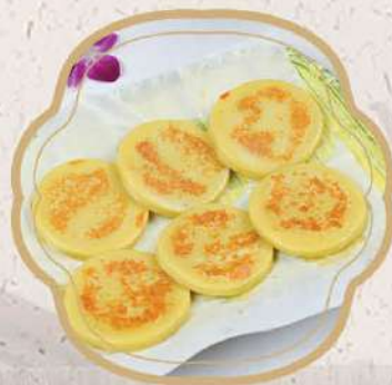
蕃薯餅 (6 PCS) $8.50 Sweet Potato Pan Cake