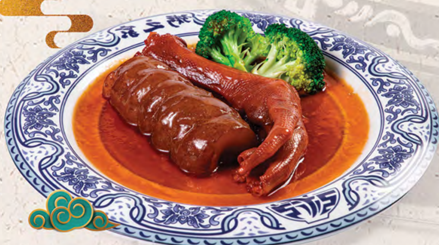
鮑汁鵝掌刺參 $28.95 Sea Cucumber & Goose Web with Abalone Sauce

碧綠鮑片海參 $58.95 Sea Cucumber & Sliced Abalone with Green Vegetable