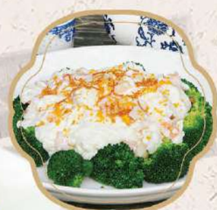
白雪尋梅 (蛋白牛奶炒蝦球帶子) $26.95

Cashew Nut & Shredded Squid with Salt & Pepper