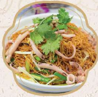
豉油皇吊片炒麵 $18.95 Soy Sauce Chow Mein with Squid