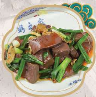
薑蔥鴨紅 $17.95 Sautéed Duck's Blood with Ginger & Scallion