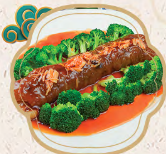
瑤柱扒原條黃玉參 $128 (10 位用)

Sea Cucumber with Dried Scallop (For 10)