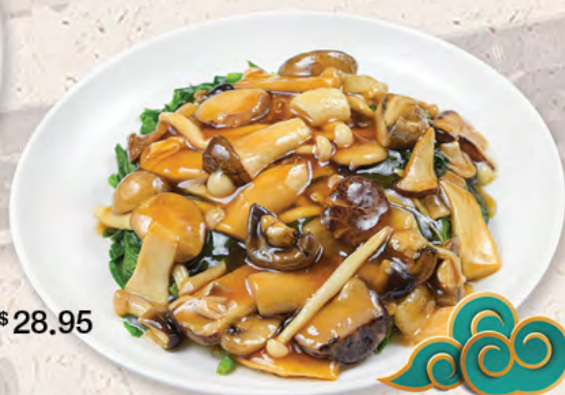
什菌竹笙扒豆苗 $28.95 Snow Pea's Leaf with Mixed Mushroom