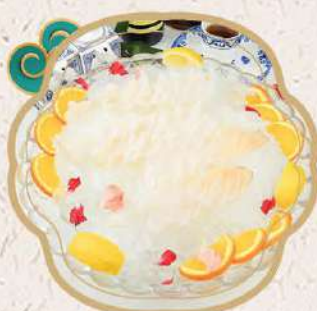
象拔蚌 S.P. Geoduck Clam Sashimi