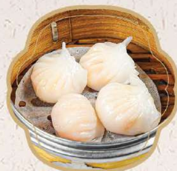
蝦餃 (4 PCS) $6.95 Steamed Shrimp Dumplings