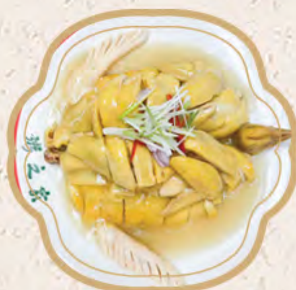
霸王雞 $17.95 / 半隻 $33.95 / 一隻 Chicken with Ginger & Scallion (Half / Whole)