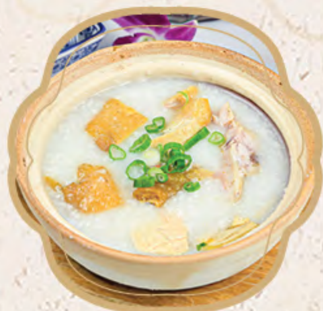
家鄉咸雞粥 $8.50 Salted Chicken Porridge