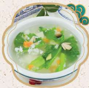
咸蛋芥菜肉片湯 $18.95 Preserved Egg, Mustard Green & Pork Soup