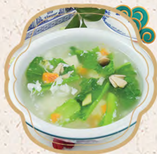
咸蛋芥菜肉片湯 $18.95 Preserved Egg, Mustard Green & Pork Soup