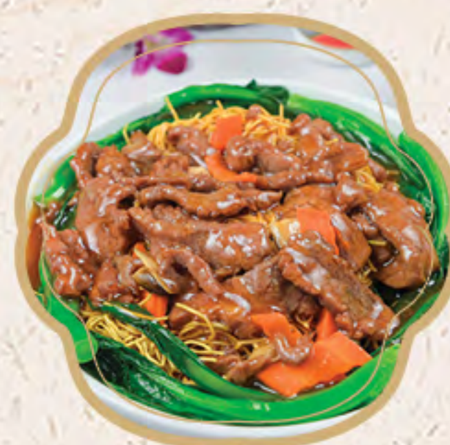
菜遠牛肉炒麵 $17.95 Beef Chow Mein with Chinese Vegetable