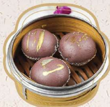
紫金流沙包 (3 PCS) $5.95 Steamed Egg Custard Buns