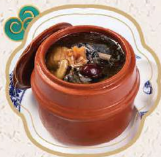
花旗參炖竹絲雞 $10.95/For 1 $98.95/For 10 Simmered Ginseng Chicken Soup with Pork & Conch