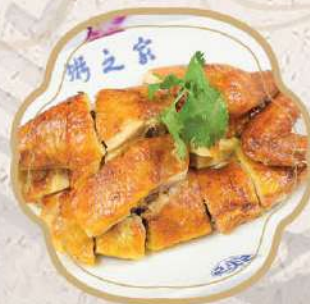
鹽焗雞 $17.95 / 半隻 $33.95 / 一隻 Baked Salted Chicken in Country Style (Half / Whole)