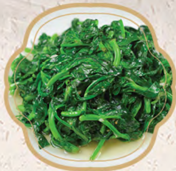
蒜蓉豆苗 $22.95 Sautéed Snow Pea's Leaf with Garlic