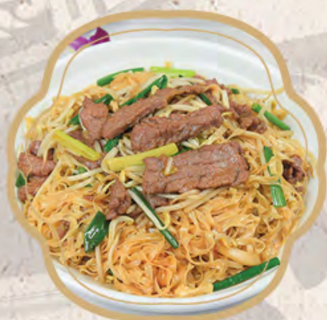
牛肉撈麵 $17.95 Beef Lo Mein