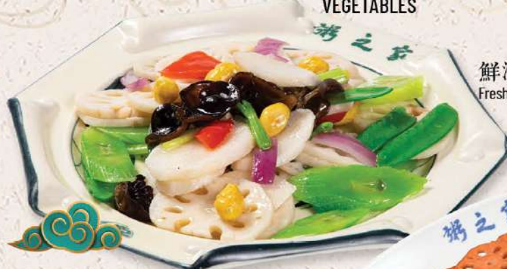
鮮淮山小炒 $21.95 Fresh Chinese Yam Delight