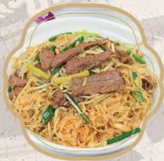
牛肉撈麵 $17.95 Beef Lo Mein