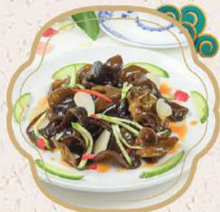
香醋拌木耳 $14.95 Black Fungus with Aged Vinegar