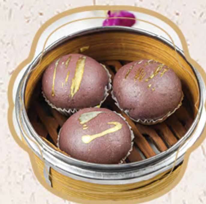
紫金流沙包 (3 PCS) $5.95 Steamed Egg Custard Buns