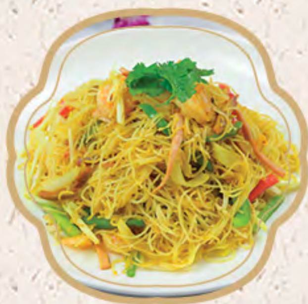
星洲炒米粉 $17.95 Singapore Style Mei Fun