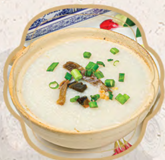
皮蛋瘦肉粥 $7.75 Pork & Preserved Egg Porridge