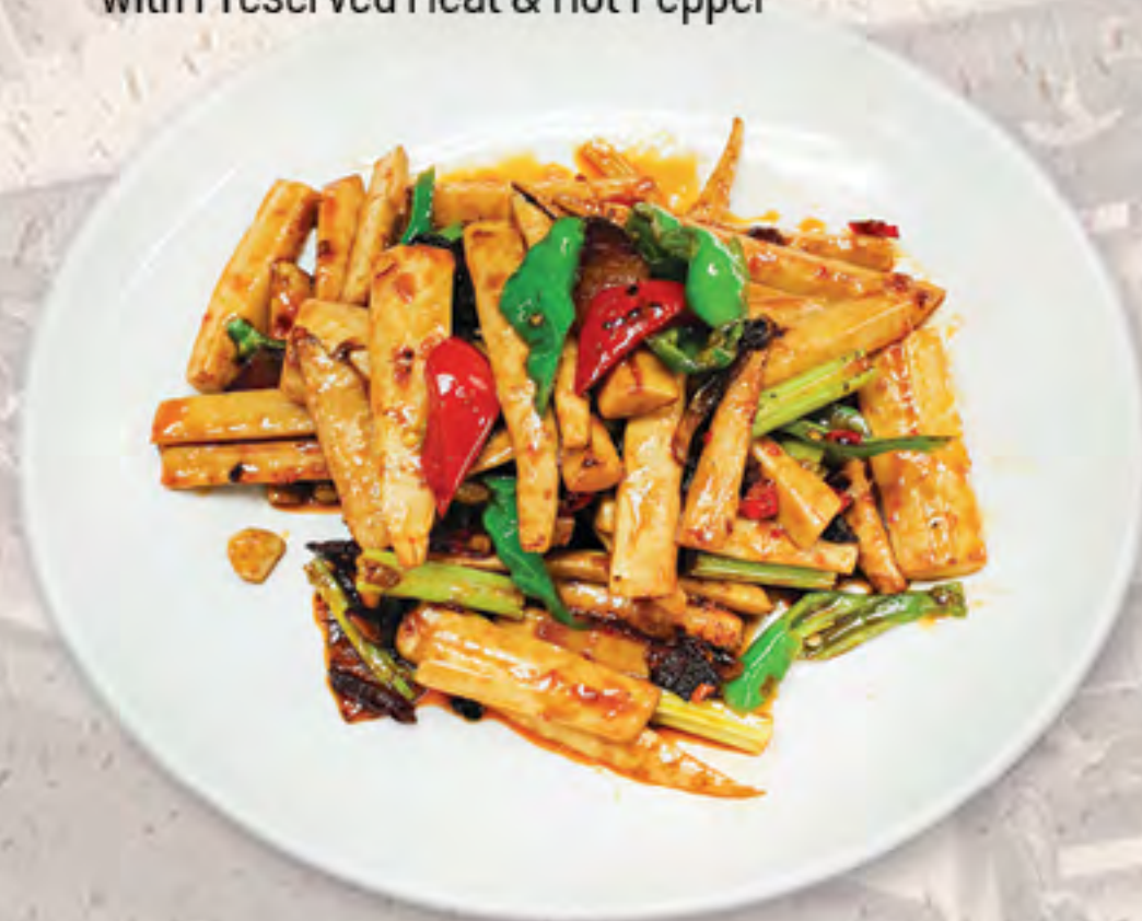
角椒臘肉炒春筍 $24.95 Sautéed Bamboo Shoot with Preserved Meat & Hot Pepper