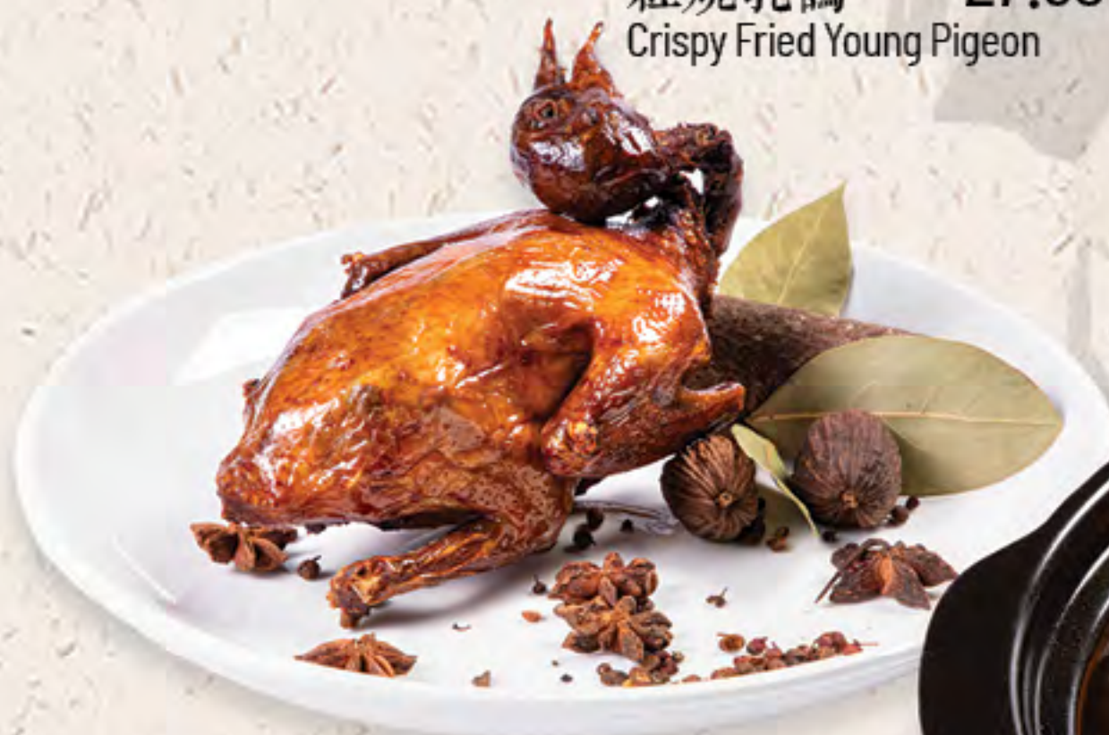
紅燒乳鴿 $27.95 Crispy Fried Young Pigeon