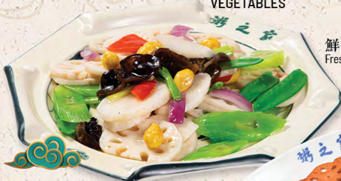
鮮淮山小炒 $21.95 Fresh Chinese Yam Delight