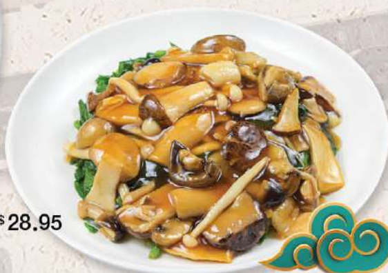
什菌竹笙扒豆苗 $28.95 Snow Pea's Leaf with Mixed Mushroom