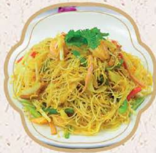
星洲炒米粉 $17.95 Singapore Style Mei Fun