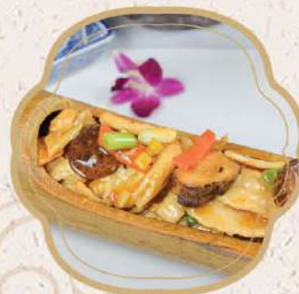
北菇滑雞燉飯 $10.95 Rice Baked with Chicken & Mushroom