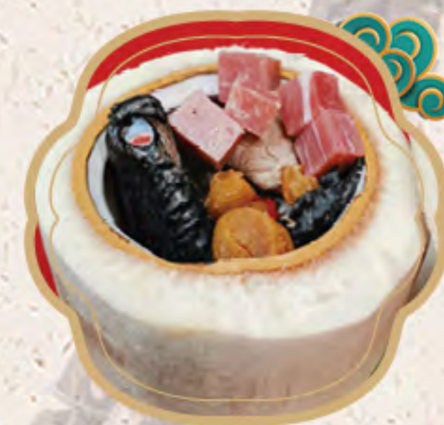
椰青燉雞湯 $20.95/For 1 Simmered Chicken Soup in Whole Coconut