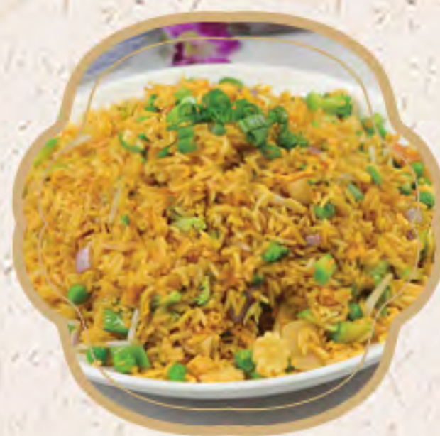
什菜炒飯 $16.95 Assorted Vegetable Fried Rice