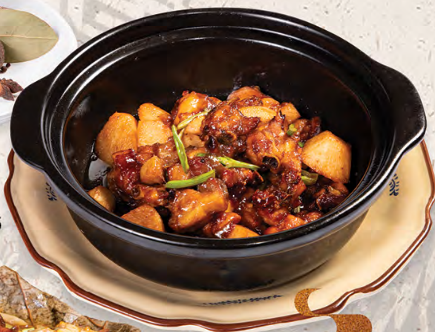
鮮淮山燜雞 $26.95 Braised Chicken & Fresh Chinese Yam