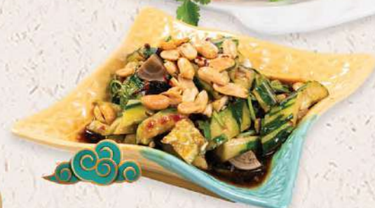
涼拌皮蛋黃瓜 $16.95 Cold Pickles with Preserved Egg