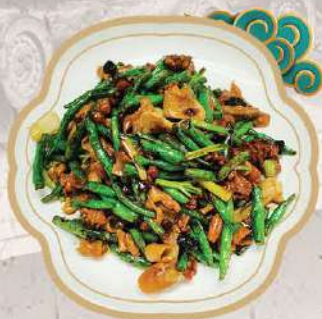
肉崧四季豆炒鵝腸 $36.95 Sautéed Goose Intestine with Pork & String Bean