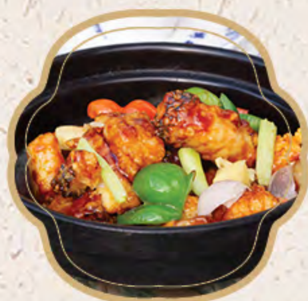
窩燒桂花魚 $38.95 Braised Chilean Sea Bass with Ginger, Scallion & Pepper