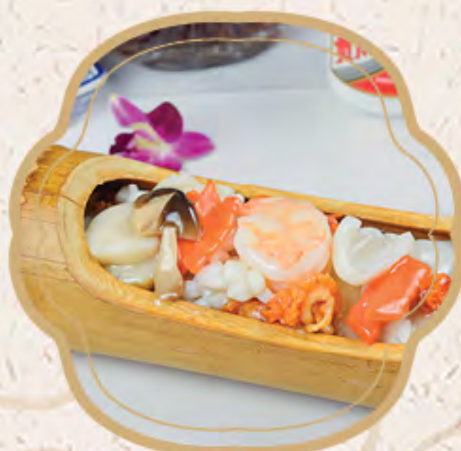
海鮮燉飯 $12.95 Rice Baked with Seafood