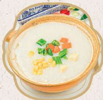
雜糧粥 $6.75 Mixed Vegetable Porridge