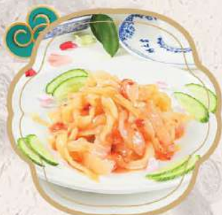
涼拌海蜇 $20.95 Cold Jelly Fish