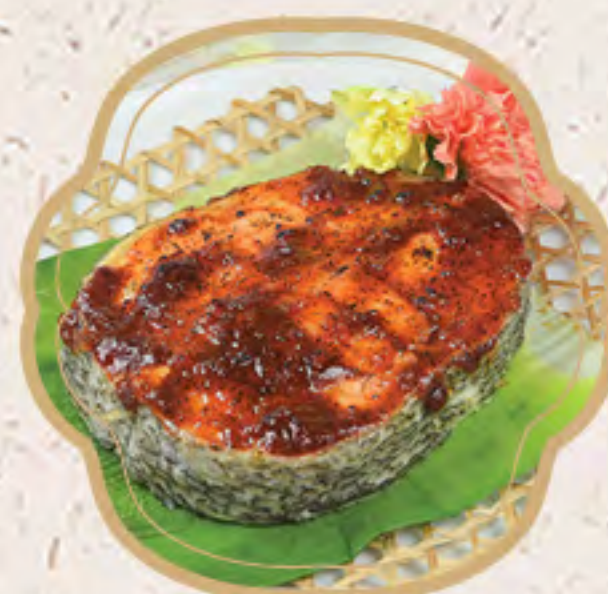
京蒜焗桂花魚 $48.95 Bakes Chilean Sea Bass with Garlic & Bean Sauce