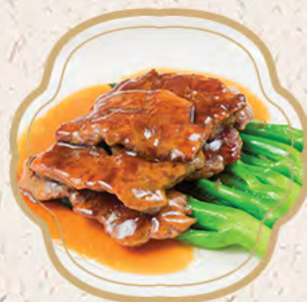
玉樹牛柳 $24.95 Sautéed Beef Filet with Chinese Broccoli