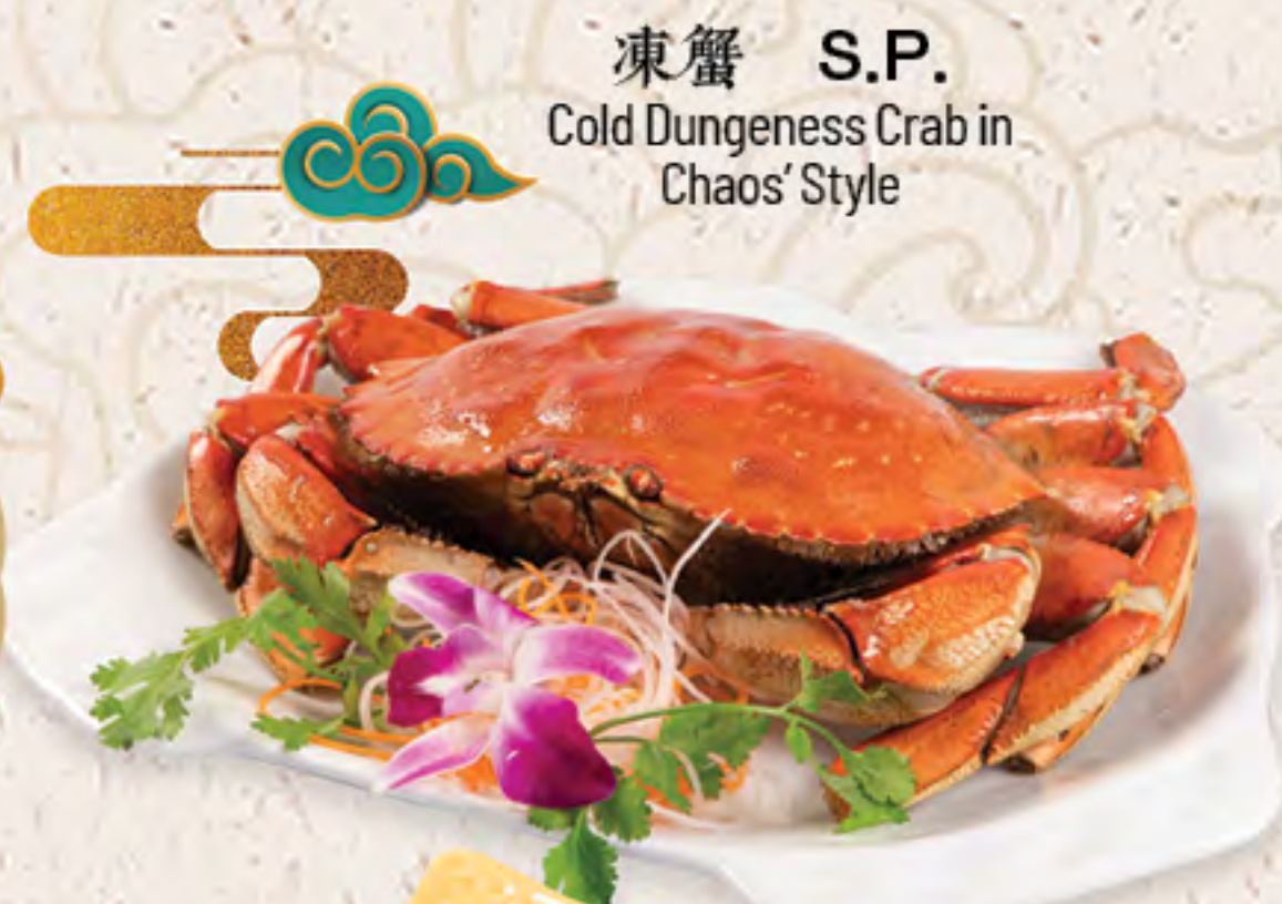
凍蟹 S.P. Cold Dungeness Crab in Chaos' Style