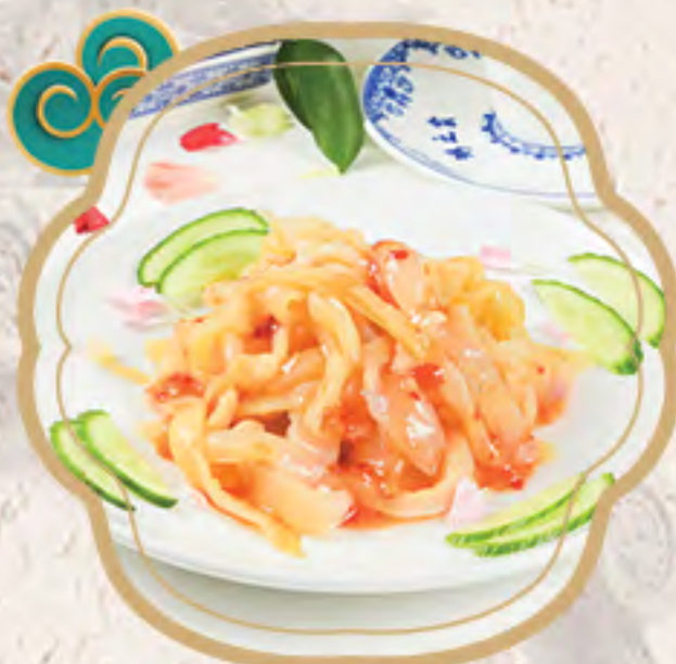
涼拌海蜇 $20.95 Cold Jelly Fish