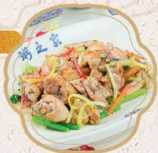
油爆田雞 $28.95 Sautéed Frog with Vegetable