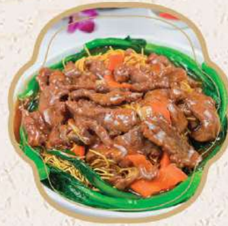
菜遠牛肉炒麵 $17.95 Beef Chow Mein with Chinese Vegetable