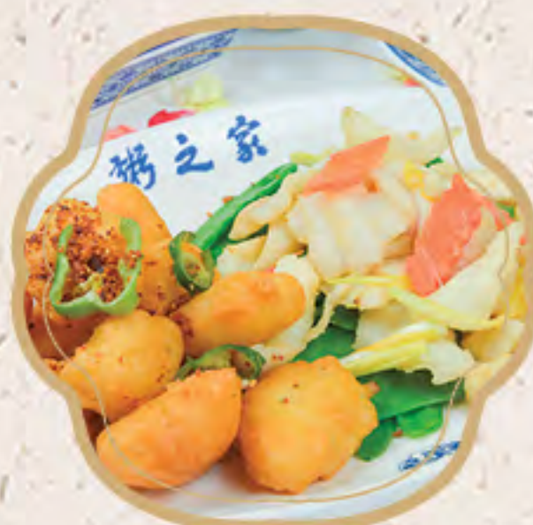
鴛鴦龍利球 $37.95 Sautéed Flounder Fillets in Two Tastes (Ginger & Scallion / Salt & Pepper)