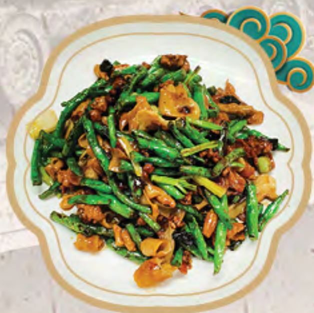
肉崧四季豆炒鵝腸 $36.95 Sautéed Goose Intestine with Pork & String Bean