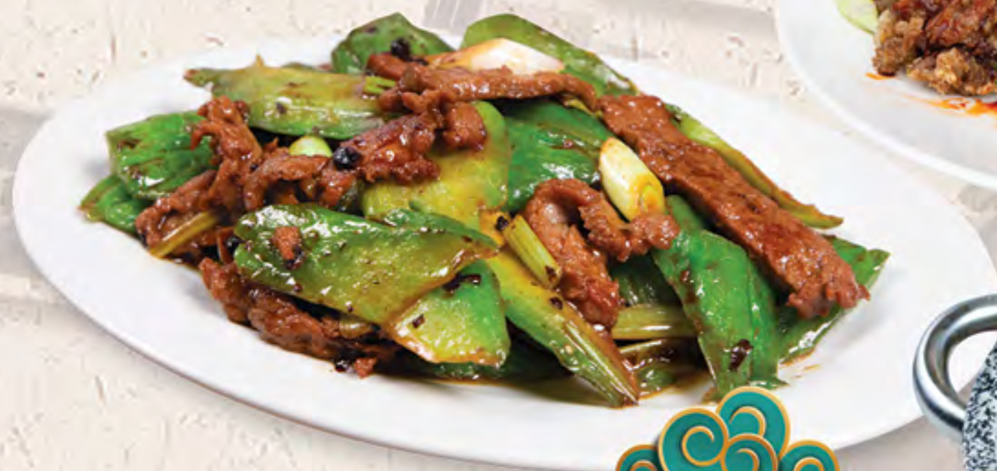
涼瓜炒牛肉 $22.95 Sautéed Beef with Bitter Melon