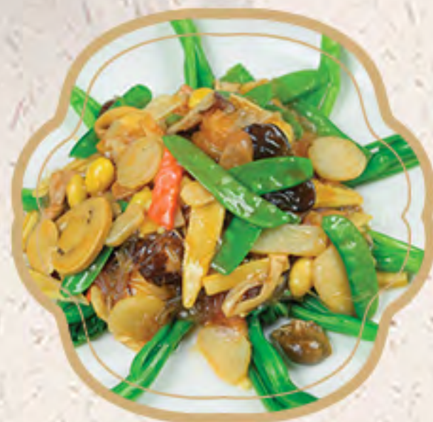
羅漢齋 $18.95 Assorted Vegetables & Vermicelli in Buddhist Style