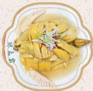
霸王雞 $17.95 / 半只 $33.95 / 一只 Chicken with Ginger & Scallion (Half / Whole)