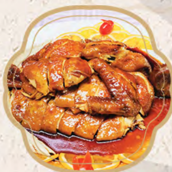
豉油雞 (需預訂) $48.95 / 一隻 Soy Sauce Chicken (Pre-order only)(Whole)