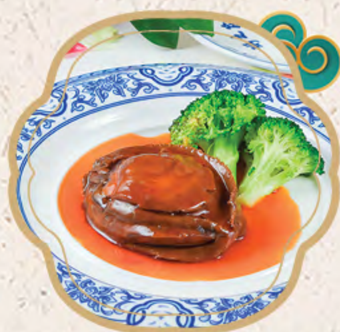
原隻紅燒鮑魚 S.P Braised Whole Abalone

Sea Cucumber with Dried Scallop (For 10)