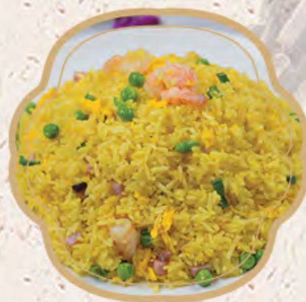
楊洲炒飯 $16.95 Young Chow Fried Rice with Pork & Shrimp