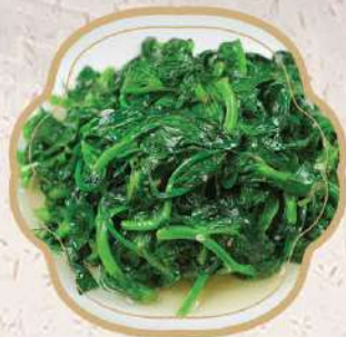
蒜蓉豆苗 $22.95 Sautéed Snow Pea's Leaf with Garlic