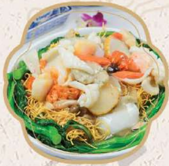
海鮮炒麵 $19.95 Seafood Chow Mein