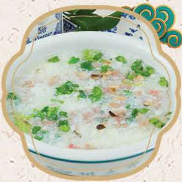
西湖牛肉羹 $20.95 West Lake Beef Soup