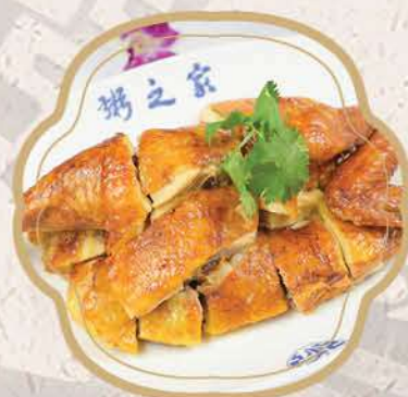
鹽焗雞 $17.95 / 半隻 $33.95 / 一隻 Baked Salted Chicken in Country Style (Half / Whole)