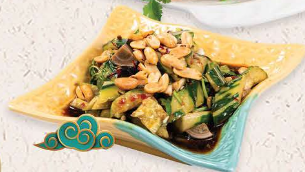
涼拌皮蛋黃瓜 $16.95 Cold Pickles with Preserved Egg