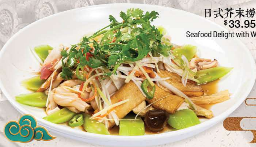
日式芥末撈三鮮 $33.95 Seafood Delight with Wasabi Sauce