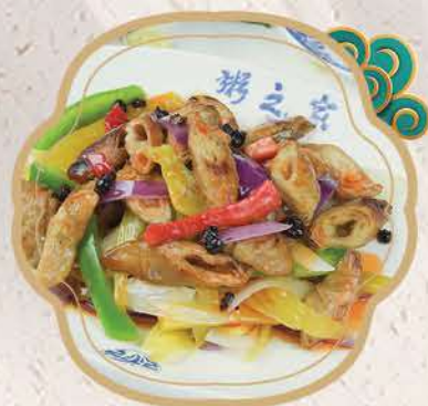
酸菜大腸 $16.95 Sautéed Pig's Intestine with Pickled Vegetable