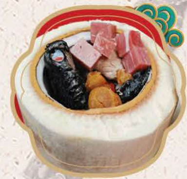
椰青燉雞湯 $20.95/For 1 Simmered Chicken Soup in Whole Coconut