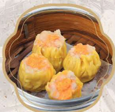
燒賣 (4 PCS) $5.95 Steamed Pork Shui Mai