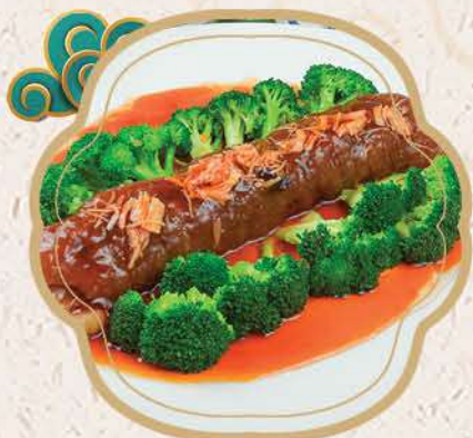
瑤柱扒原條黃玉參 $128 (10 位用)

Sea Cucumber with Dried Scallop (For 10)