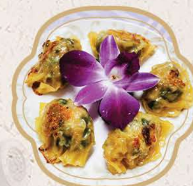
香煎韭菜餃 (5 PCS) $6.50 Pan Fried Pork and Chive Dumplings