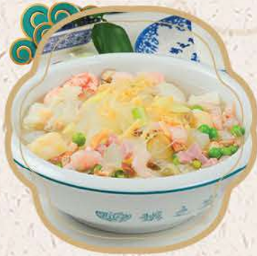
什錦冬瓜湯 $18.95 Winter Melon Soup with Chicken, Pork & Shrimp