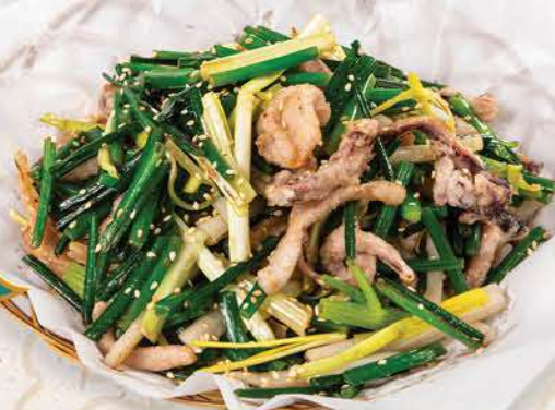
粥之家小炒王 $26.95 Sautéed Dried Shrimp & Squid with Chive