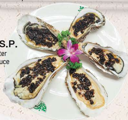
豉汁蒸生蠔 S.P. Steamed Live Oyster with Black Bean Sauce