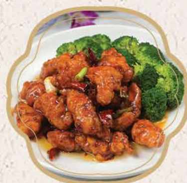
左宗雞 $20.95 General Tso's Chicken