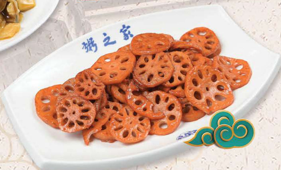
南乳炒藕片 $18.95 Sautéed Lotus Root with Bean Paste