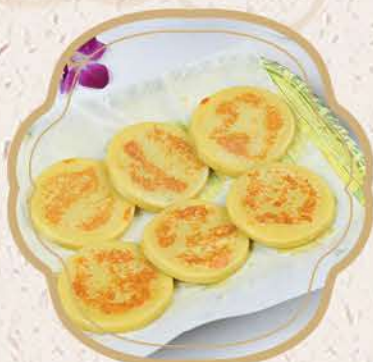
蕃薯餅 (6 PCS) $8.50 Sweet Potato Pan Cake