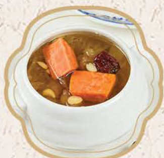
南北杏炖雪耳 $10.95 / each

Simmered Snow Fungus with Apricot Kernels