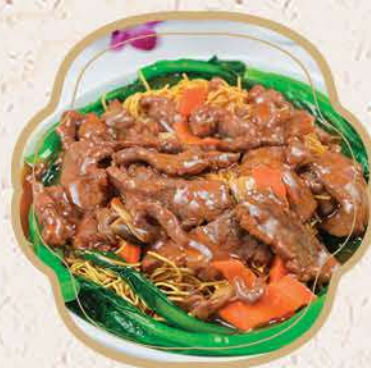
菜遠牛肉炒麵 $17.95 Beef Chow Mein with Chinese Vegetable