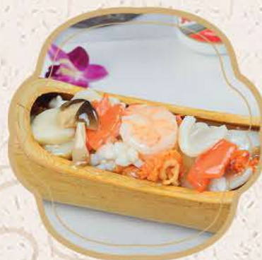
海鮮燉飯 $12.95 Rice Baked with Seafood