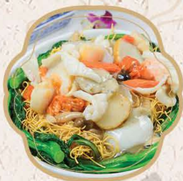
海鮮炒麵 $19.95 Seafood Chow Mein