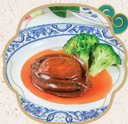
原隻紅燒鮑魚 S.P. Braised Whole Abalone

Sea Cucumber with Dried Scallop (For 10)