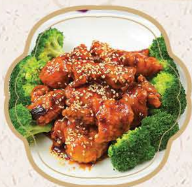
芝麻雞 $20.95 Sesame Chicken