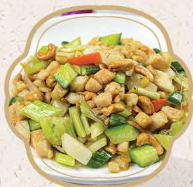
腰果雞丁 $20.95 Sautéed Chicken with Cashew Nuts