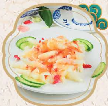
泰式鳳爪 $22.95 Cold Boneless Chicken Feet with Thai Sauce