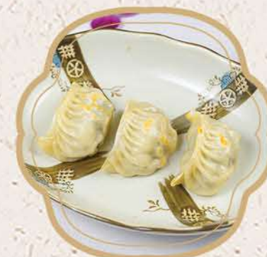
香煎鍋貼 (3 PCS) $3.95 Pan Fried Pork Dumpling