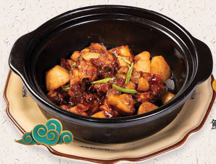
鮮淮山燜雞 $26.95 Braised Chicken & Fresh Chinese Yam