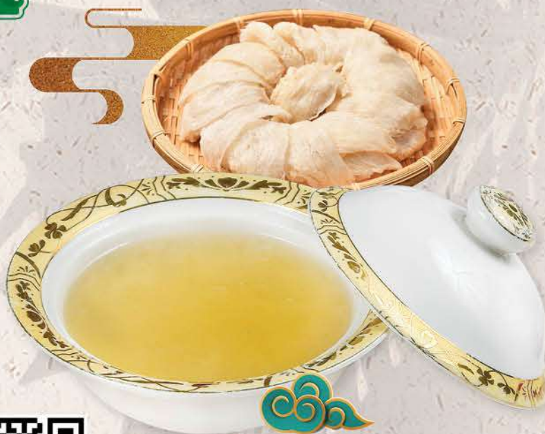
冰糖炖燕窩 $28/each Simmered Natural Bird's Nest with Rock Candy