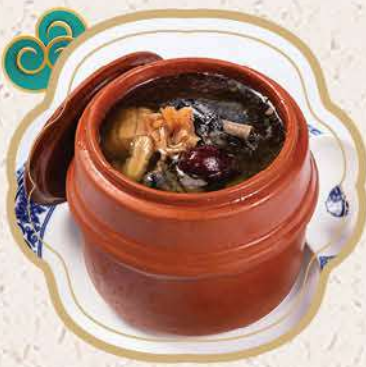
花旗參炖竹絲雞 $10.95/For 1 $98.95/For 10 Simmered Ginseng Chicken Soup with Pork & Conch