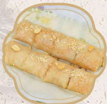
甜薄餐 $8.50 Cantonese Sweet Pancake