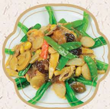
羅漢齋 $18.95 Assorted Vegetables & Vermicelli in Buddhist Style