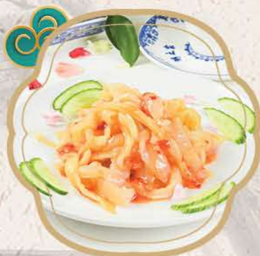
涼拌海蜇 $20.95 Cold Jelly Fish