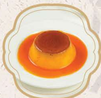
焦糖炖蛋 $3.95 / each Creme Brulee

Simmered Snow Fungus with Apricot Kernels