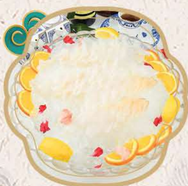
象拔蚌 S.P. Geoduck Clam Sashimi