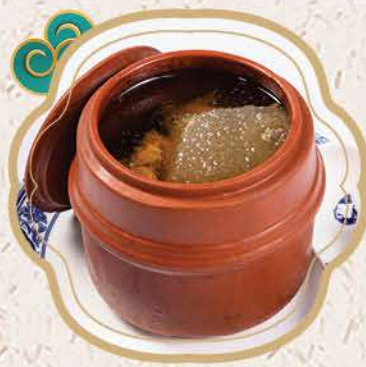
原盅干貝冬瓜湯 $10.95/For 1 $98.95/For 10 Simmered Dried Scallop Winter Melon Soup with Chicken & Pork