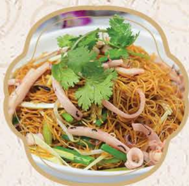
豉油皇吊片炒麵 $18.95 Soy Sauce Chow Mein with Squid