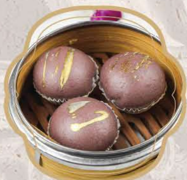
紫金流沙包 (3 PCS) $5.95 Steamed Egg Custard Buns