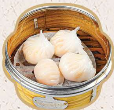
蝦餃 (4 PCS) $6.95 Steamed Shrimp Dumplings