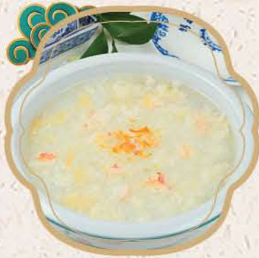
百花魚肚羹 $25.95 Fish Maw & Seafood Soup