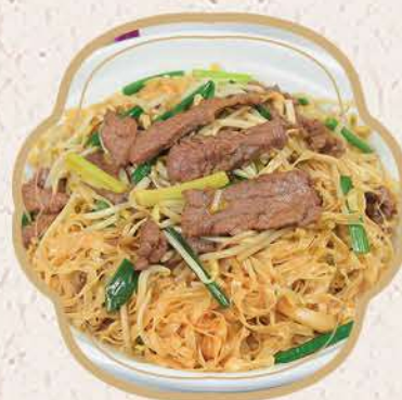
牛肉撈麵 $17.95 Beef Lo Mein