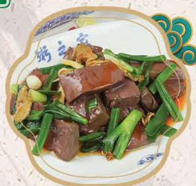
薑蔥鴨紅 $17.95 Sautéed Duck's Blood with Ginger & Scallion