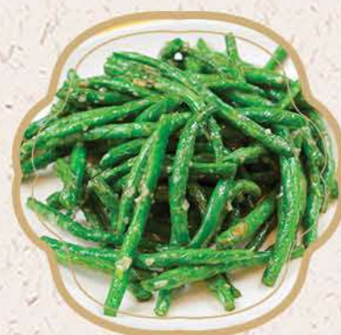
蒜蓉四季豆 $18.95 Sautéed String Bean with Garlic