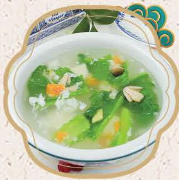
咸蛋芥菜肉片湯 $18.95 Preserved Egg, Mustard Green & Pork Soup