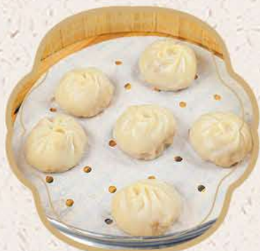
上海小籠包 (6 PCS) $8.95 Small Juicy Bun in Shanghai Style