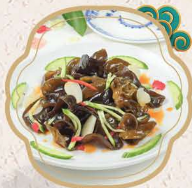
香醋拌木耳 $14.95 Black Fungus with Aged Vinegar