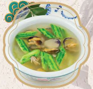
勝瓜花蜆湯 $21.95 Manila Clam & Squash Soup