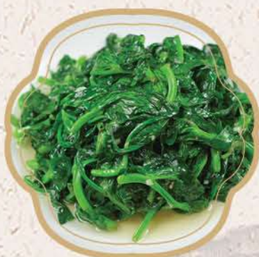
蒜蓉豆苗 $22.95 Sautéed Snow Pea's Leaf with Garlic