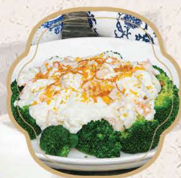
白雪尋梅 (蛋白牛奶炒蝦球帶子) $26.95

Cashew Nut & Shredded Squid with Salt & Pepper