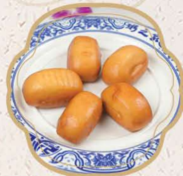
炸饅頭 (5 PCS) $4.95 Fried Bread