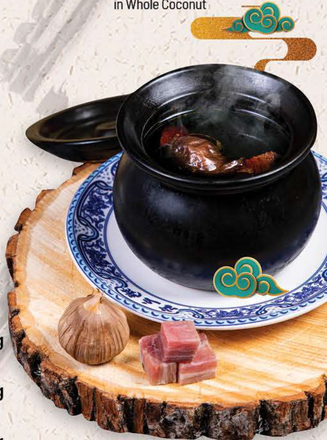
金蒜炖雞湯 $10.95/For 1 $98.95/For 10 Simmered Chicken Soup with Black Garlic