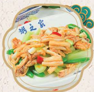
X.O. 蜜豆桂花蚌 $38.95

Sautéed Sea Clam & Sweet Pea Pod with X.O. Sauce