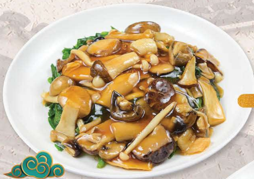
什菌竹笙扒豆苗 $28.95 Snow Pea's Leaf with Mixed Mushroom