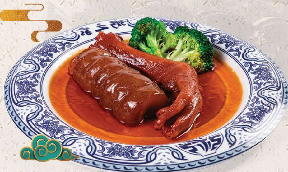
鮑汁鵝掌刺參 $23.95 Sea Cucumber & Goose Web with Abalone Sauce

碧綠鮑片海參 $54.95 Sea Cucumber & Sliced Abalone with Green Vegetable