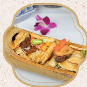
北菇滑雞燉飯 $10.95 Rice Baked with Chicken & Mushroom