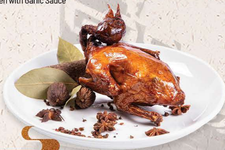
紅燒乳鴿 $27.95 Crispy Fried Young Pigeon